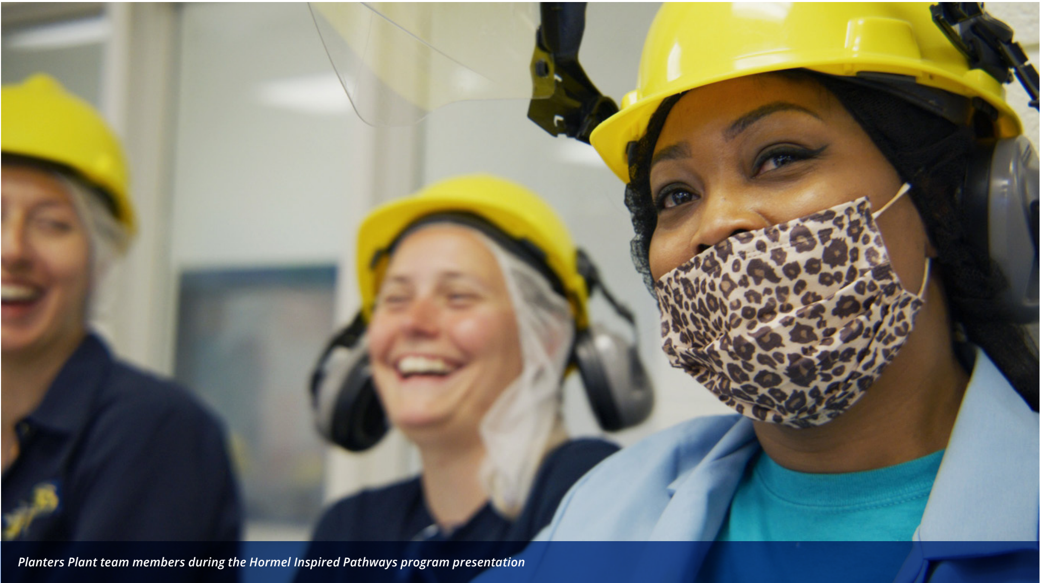
Planters Plant team members during the Hormel Inspired Pathways program presentation