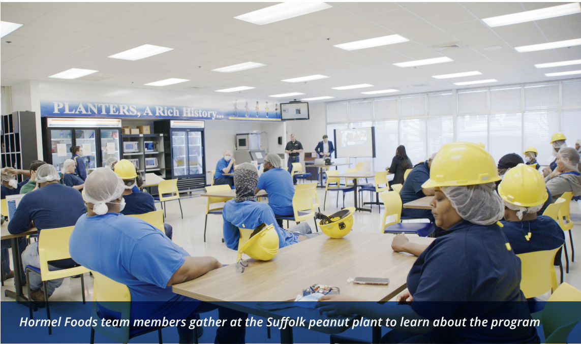
Hormel Foods team members gather at the Suffolk peanut plant to learn about the program